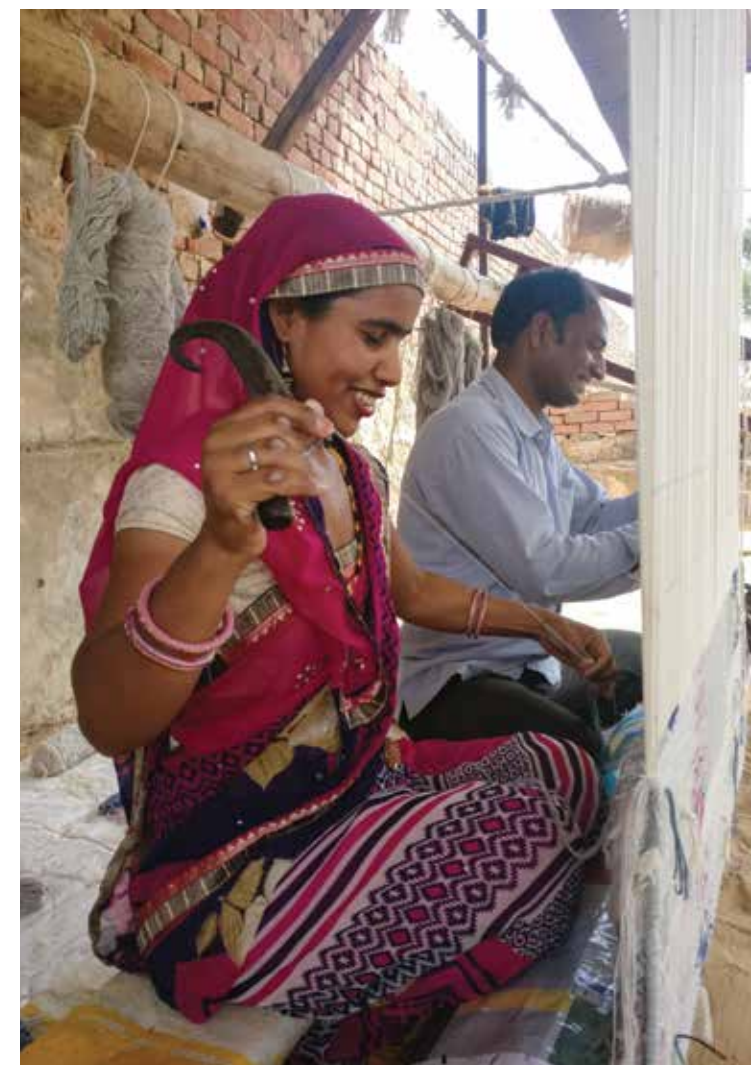
Couple Weaving.

While Jaipur Rugs is into hand knotted and hand tufted weaving techniques, the premium range of its pure silk rugs incorporate 196 knots in one square inch. Jaipur Rugs thus has a stunning range on offer, where each range has its own unique characteristic and design that sets it apart, professing the expert skills of the weaver and the designer.