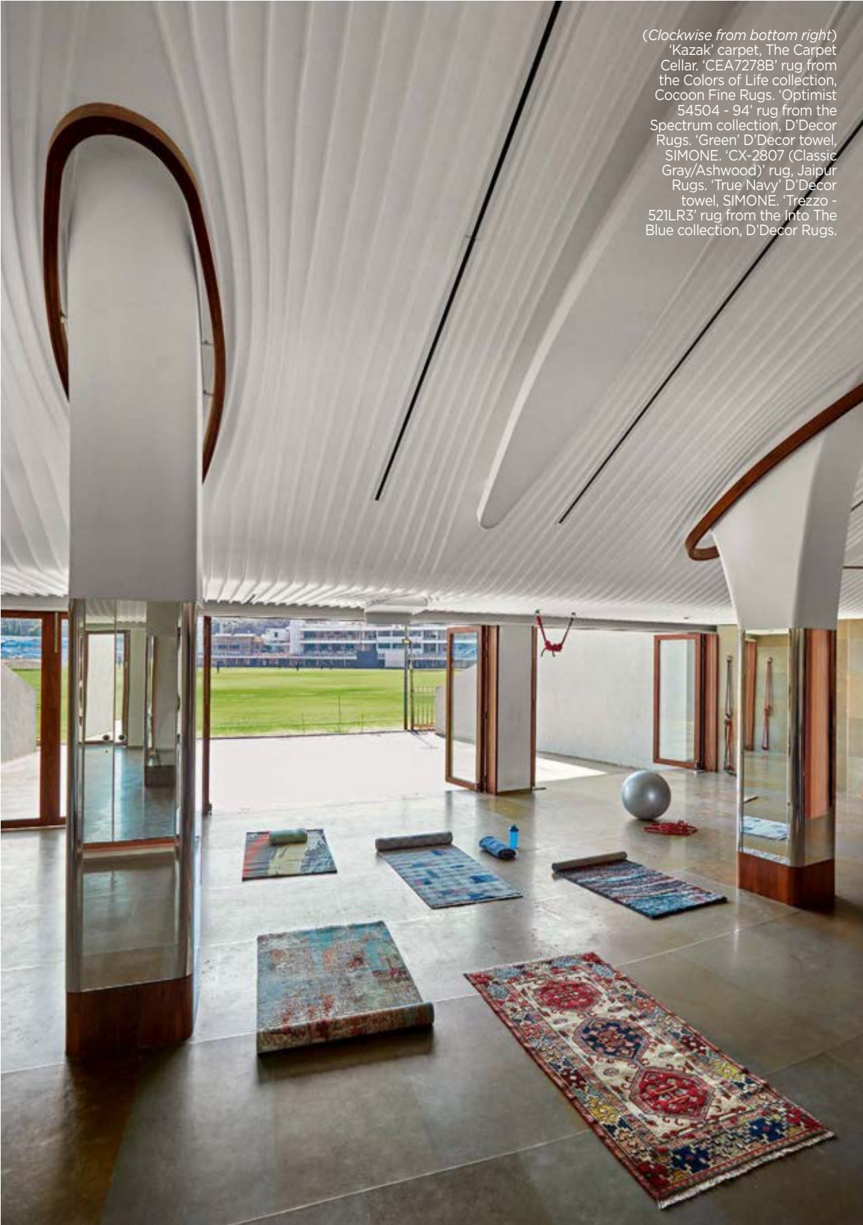
(Clockwise from bottom right) 'Kazak' carpet, The Carpet Cellar. 'CEA7278B' rug from the Colors of Life collection, Cocoon Fine Rugs. 'Optimist 54504 - 94' rug from the Spectrum collection, D'Decor Rugs. 'Green' D'Decor towel, SIMONE. 'CX-2807 (Classic Gray/Ashwood)' rug, Jaipur Rugs. 'True Navy' D'Decor towel, SIMONE. 'Trezzo - 521LR3' rug from the Into The Blue collection, D'Decor Rugs.