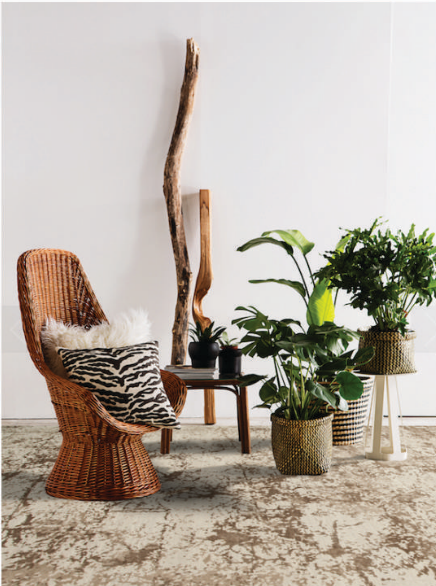
The Jaipur Rugs experience at Luxury Lifestyle Weekend

The leader in hand-knotted rugs, Jaipur Rugs, will be showcasing its latest line of rugs, Tattvam, at Luxury Lifestyle Weekend. These rugs were created in collaboration with celebrity interior designer Gauri Khan. Jaipur Rugs will put on a live demonstration of the traditional charkha, a tool that is still used by their artisans to keep the dying craft of hand-spinning raw wool into thread alive.