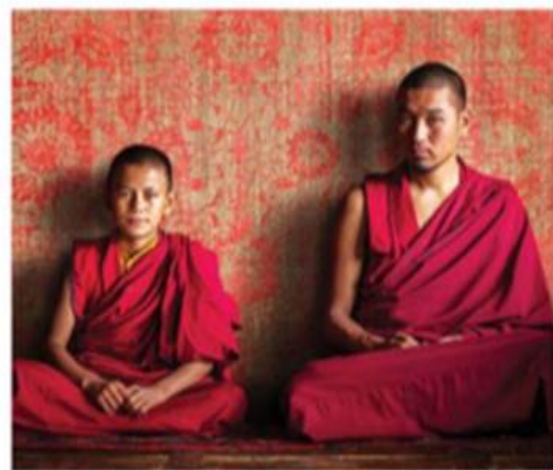
Jaipur Rugs Designed as part of The Chaos Theory collection, Gaia is a transitional rug that explores erosion in nature, and overlays that pattern on a traditional rug. It is made from the finest hand-carded, hand-spun wool and bamboo silk. ₹ 2,88,000