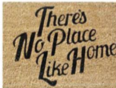
Sanctum A distinctive way of expressing oneself, this simple coir mat is an elegant reminder of where your heart lies. ₹ 950