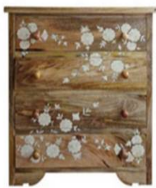
Freedom Tree Crafted with age-old decorative techniques, the Inlay Chest of Drawer is made from sheesham wood. The floral detailing adds delicate charm to the three-drawer dresser. ₹ 33,400