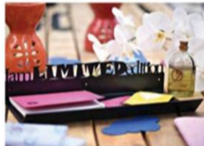
Sanctum This wall rack with a metal powder coating provides useful storage space as well as makes quite a unique style statement. ₹ 1,250