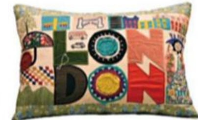
Surprise Home Linen Bring out your inner hipster with this handcrafted cushion featuring applique embroidery, crochet and patchwork. The multicolour cushion is a blend of cotton, velvet and linen. ₹ 950