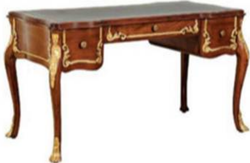
Anteak Add luxurious elegance to your home with this Louis XV writing desk. The handmade product made from teak wood with gold leaf carvings is available in a mahogany walnut shade. ₹ 1,38,000 onward