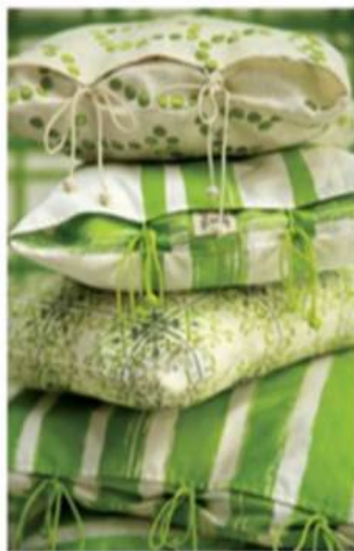
No-Mad An assortment of lovely green-hued cushions showcasing intricate embroidery, brush strokes and fine stitching. These cushion covers have handmade string closures which adds to its charm. ₹ 1,450 to ₹ 3,950