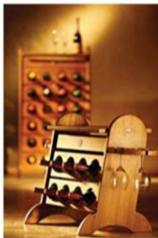
Ficus Fine Living This Kodai Wine Rack is made from hardwood of old Scandinavian ships and offers plenty of storage. The rich smooth finish and painstaking attention to detail exudes a sense of grace, style and durability. ₹ 61,875