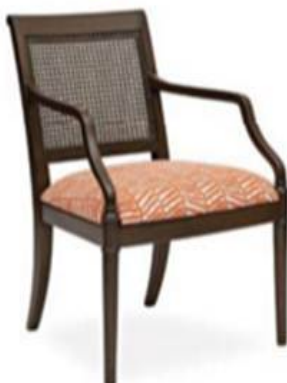
Iqur+Ritz This Gymkhana Cane Chair is handcrafted in solid beech wood. Part of a collection that incorporates British colonial style, this beauty is adorned with the lovely Bamboo Rust upholstery from brand Safomasi. ₹ 41,975