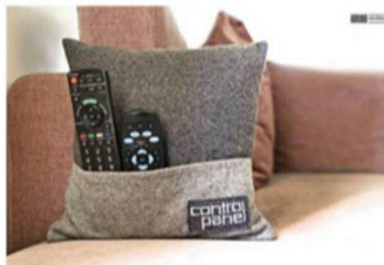
Random In Tandem This unique Control Panel cushion from the Technotrance collection comes with a pocket to store multiple remotes and other articles. This rich grey cushion is made from felt and adds a cosy touch to a modern decor. ₹ 1,050