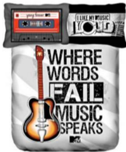
Portico The MTV for Portico collection with music-themed designs in striking colour combinations is for the young and the young at heart. The bed linen is made from 100 per cent super soft cotton and cushions are made from 100 per cent polyester satin. ₹ 2,899 (bed linen); ₹ 5,999 (comforter); ₹ 699 (cushions)