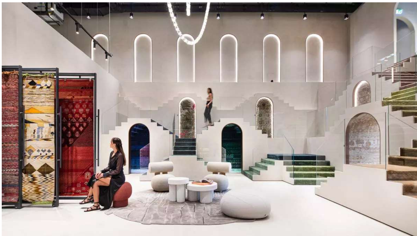
A picture of the Jaipur Rugs store in Dubai